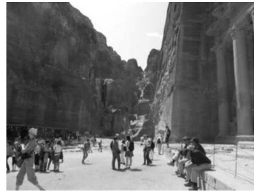
Visitors in Petra

Shop selling authentic Bedouin crafted silver in Petra.